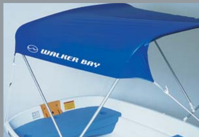
BIMINI TOP Easily retractable and fits all Rigid Dinghies. Available in Blue. Part #923610