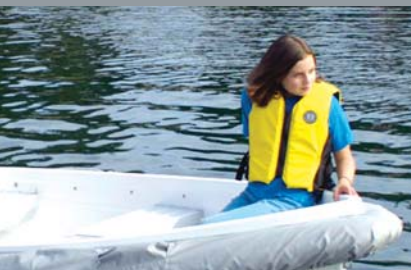
RID TUBE COVER Keeps RID tube clean and protects against harmful ultra violet rays on & off the water. Available in Gray. RID 275 Part #921573 RID 310 Part #921574