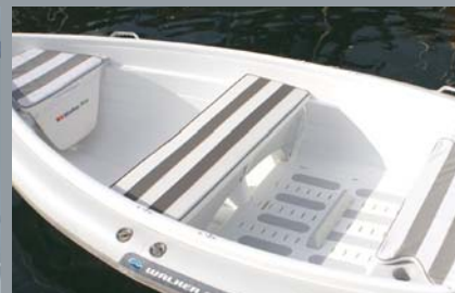
DELUXE SEAT CUSHIONS (set of 3) Add more comfort to your boat. Bow cushion features an integrated bag and handle. WB8/RID 275 Part #925039 WB10/RID 310 Part #925040