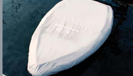
MOORING COVERS (available for all boats) Keep your boat clean, dry & protected from the elements. Drainage Support Kit & Tie Down Straps recommended for boats stored outdoors (sold separately). Blue or Gray. See website for part numbers and information.