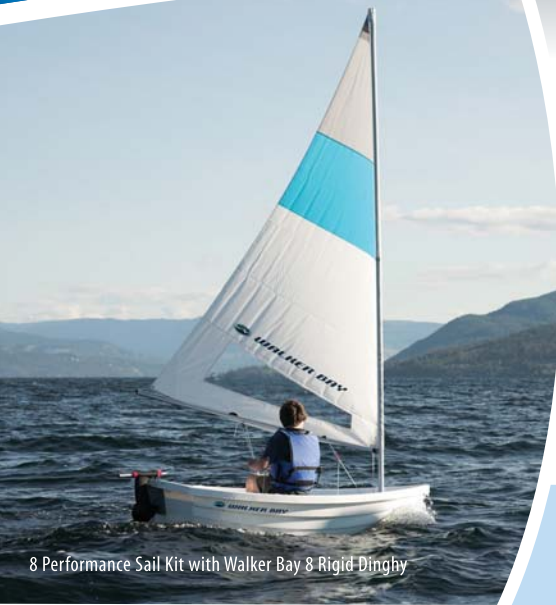
8 Performance Sail Kit with Walker Bay 8 Rigid Dinghy

MODEL: 8 PERFORMANCE PLUS SAIL AREA: 50 sq. ft. / 4.6 m 2 MAST HEIGHT: 14'8" / 4.47 m