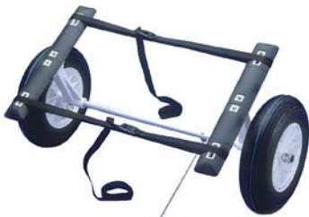
BOAT DOLLY Large 16" x 4" pneumatic wheels are mounted on injection molded rims. Fits all Walker Bay boats. Part #912000